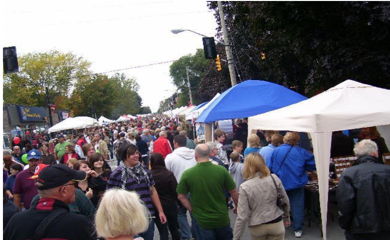
A BUSY DAY AT APPLEFEST, BRIGHTON.

Zone I, Durham-from Pickering to Bowmanville North to Uxbridge.